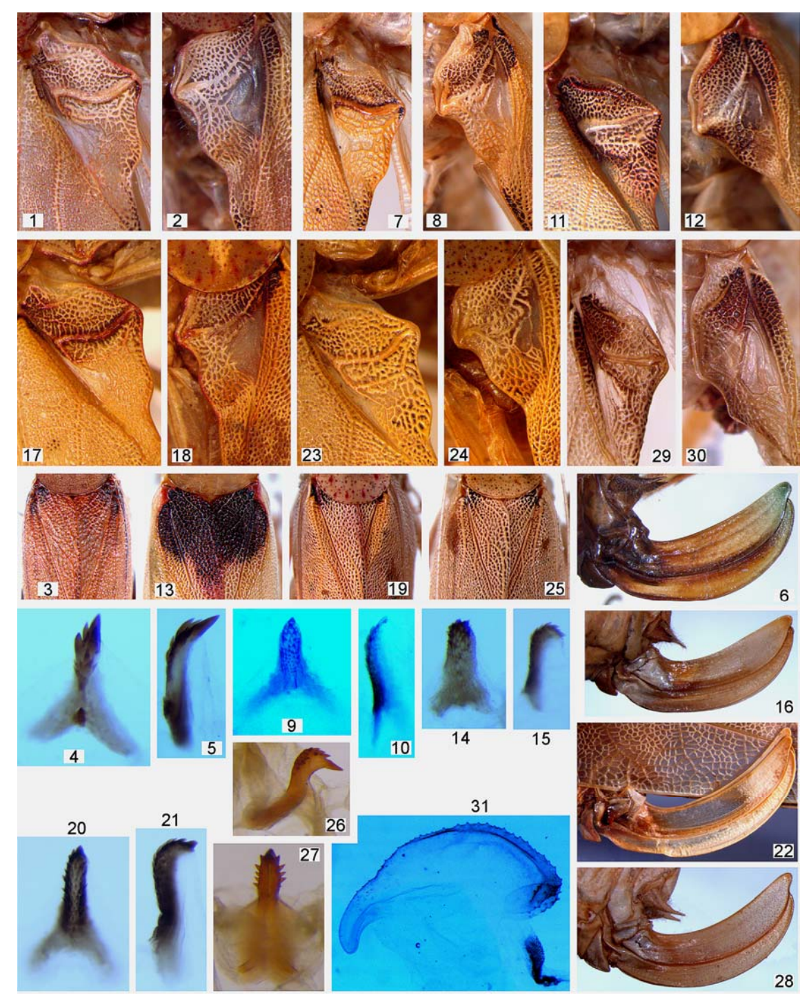
Fig. II : 1-31. Stictophaula : 1-6, S. mistshenkoi sp. n.; 7-10, S. coco sp. n.; 11-16, S. aspersa sp. n.; 17-22, S. multa sp. n.; 23-28, S. rara sp. n.; 29-31, S. recens sp. n. Proximal part of dorsal field of male upper (1, 7, 11, 17, 23, 29) and lower (2, 8, 12, 18, 24, 30) tegmina; same part of female tegmina (3, 13, 19, 25); median sclerites of male genitalia from below (4, 9, 14, 20, 27) and from side (5, 10, 15, 21, 26, 31); ovipositor from side (6, 16, 22, 28).